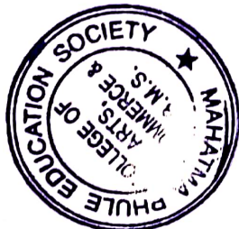
I/C Principal Mahatma Phule Education Society College of Arts, Commerce & B.M.S. Jerbai Wadia Road, Parel, Mumbai-400 012.

Note : The Nodal Agency has issued the electronic certificate on the basis of information provided by the candidate in his Application Form. The appointing authority should verify the original records/certificates of the candidate while considering him for appointment, as the Nodal Agency is not responsible for the same. The candidate must fulfil the minimum eligibility conditions for SET as laid down in the notification for SET.